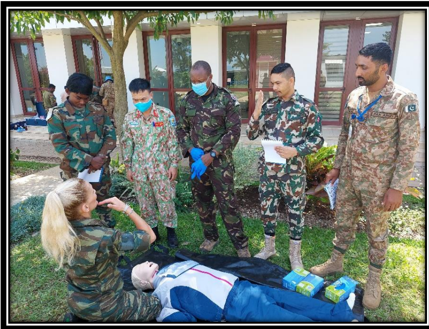
Field Medical Assistants Course (FMAC) in Entebbe/Uganda