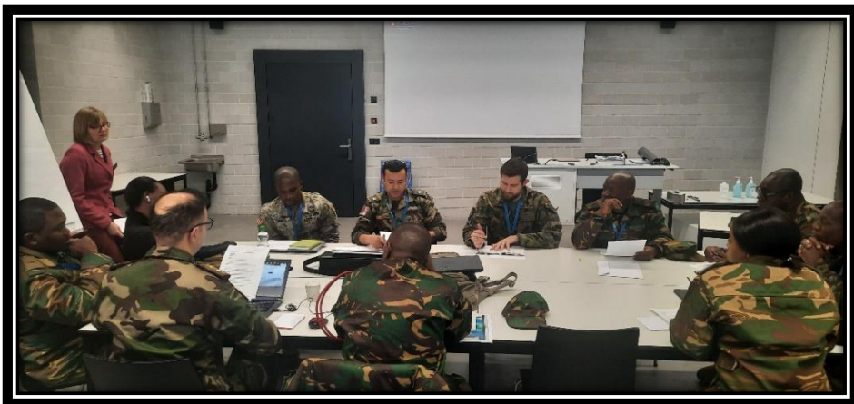
OPLOG Reinforcement Training Package TOT Course delivered in Switzerland

For UN Police training, ITS is implementing the UN Police Training Architecture Programme. This programme includes designing and developing new materials in line with the Strategic Guidance Framework (SGF) for International Policing.