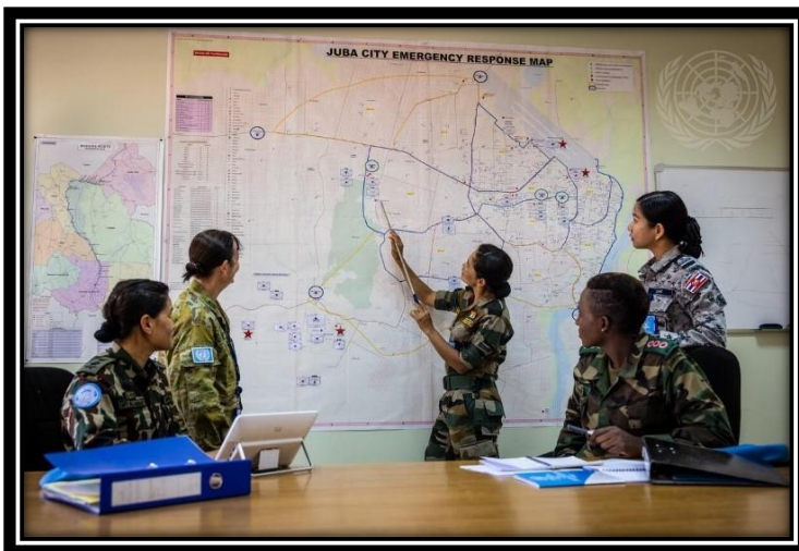
Staff Officers in UNMISS

Key to the success of our mandate implementation is the participation of women at all levels in the UN's military and police components, both as individuals as well as part of formed contingents. All T/PCCs are asked to pledge to achieve the Secretary-General's Uniformed Gender Parity Strategy targets for 2023 and deploy a minimum women representation of 20% of UNMEM and SOs; 10% of contingent troops; 24% of IPO; and 13% of FPU. These percentages will increase for 2024, so Ministerial pledges should take that into consideration and be planned accordingly. All Infantry Battalions and Companies that are deployed in missions with protection of civilians responsibilities should include Engagement Platoons/Teams composed of 50 percent men and 50 percent women.