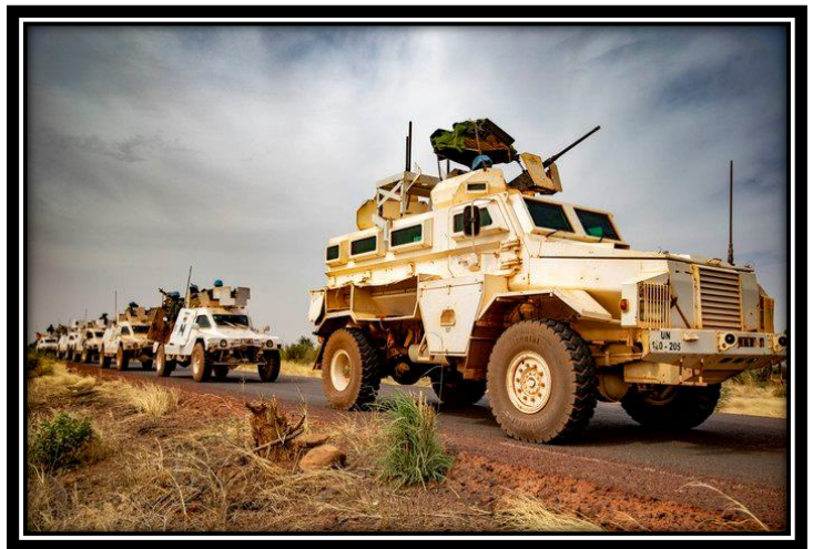
Armed APCs operating in MINUSMA

• Maneuvering units - currently needed in our missions or are very likely to be needed in the near future: infantry battalions at higher levels in the PCRS, quick reaction forces at company level and recce units at company level. One relatively new requirement is the inclusion of an engagement platoon in all infantry units deployed in missions with Protection of Civilians mandates. Military units with appropriate mine-resistant vehicles and APCs are critical to strengthen the safety and security of peacekeepers. There is also a need for smaller vehicles, such as high-mobility light tactical vehicles (HMLTV) and reconnaissance vehicles.