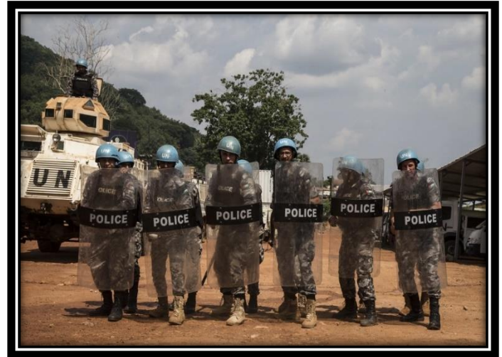
FPU in MINUSCA

• FPUs, particularly francophone and mixed gender units available for rapid deployment and equipped with state-of-the-art capabilities, including SWAT, rapid reaction, canine and riverine elements (i.e. two FPUs at rapid deployment level with SWAT capabilities, one of them being francophone). Capacity Builders to support FPU PCCs deployed in MINUSMA, MINUSCA, MONUSCO with pre-deployment training; additional, new, or changing COE to meet revised Statement of Unit Requirements (SUR); and assistance to FPU PCCs deploying to high-risk missions to enhance their gender-sensitive absorption capacities to meet parity targets;