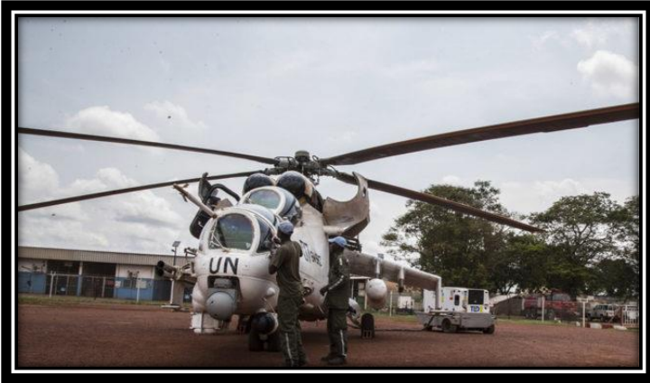
Attack helicopter deployed in MINUSCA in 2017

Some of the most impactful pledges of military units will include: