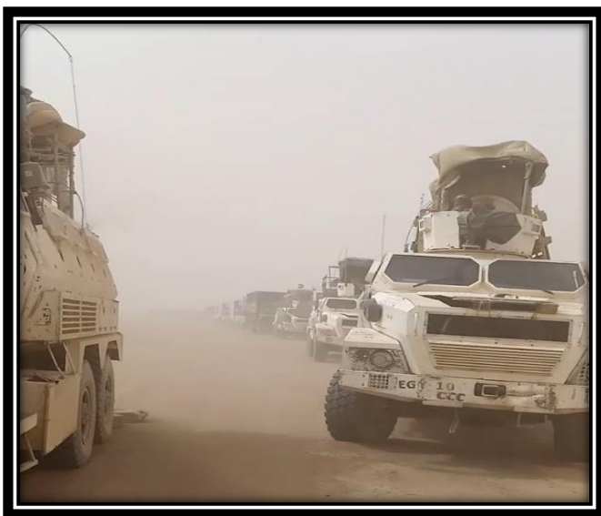
Logistic Convoy in MINUSMA

• Aviation units - one of the most critical specialized capabilities deployed to peacekeeping. Its multiple functions contribute to mandate delivery through operational and logistics tasks, including support to the safety and security of peacekeepers. Well-equipped aviation assets are in high demand and short supply. Attack, armed and medium utility helicopters; and tactical airlift aircrafts are the most important air assets Member States can contribute to the UN at the moment, and many that have these capabilities have not registered these assets in the PCRS.