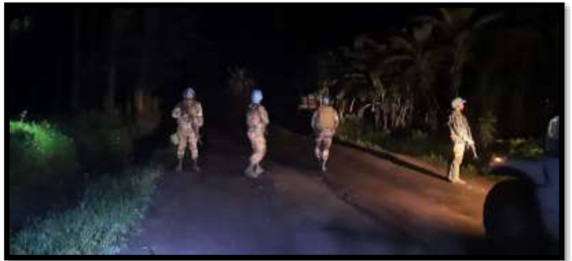
Night operations require better support

• Peacekeeping-intelligence-led operations have become more critical as UN missions expand into complex environments facing multiple threats. Military and police activity must be shaped by focused, coordinated and accurate intelligence to ensure effective operations. In the context of peacekeeping intelligence, it is critical to collect and use gender-responsive information acquired from human sources more effectively,