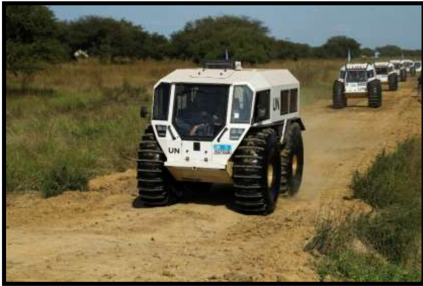
UNMISS all-terrain utility task vehicles pilot test