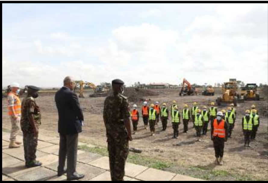
Heavy Engineering Equipment (HEE) Operator Course in Nairobi/Kenya

The TPP will continue to provide engineering, medical and C4ISR training in English and French through multiple training options (in-situ, remote and mixed delivery) while exploring opportunities to further address capability gaps in airfield/ runway rehabilitation and to address the gender gap in UN peacekeeping.