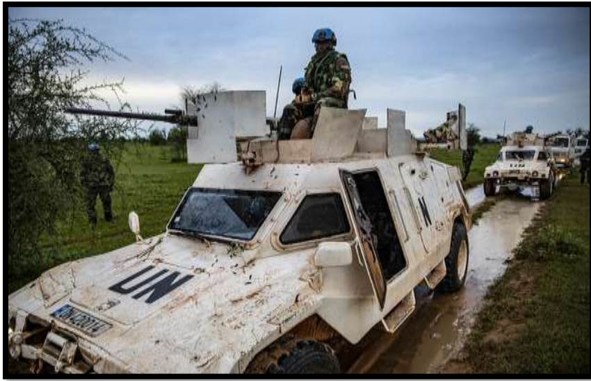
Logistic Convoy conducted in a difficult terrain

The importance of effective enabling units (e.g. multi-role engineers, transport, signals, and medical) to a mission cannot be overstated. This has been a critical point for missions in regions with limited transportation infrastructure and scarce local resources. Transportation units with integrated force protection elements such as combat convoy units, and engineering construction and combat units are required. Enabling units must be capable of protecting themselves autonomously. With the increasing number of demanding tasks, missions are not always able to spare infantry units or FPU to protect military enabling units. EOD/EIDD units are also critical for the safety and security of