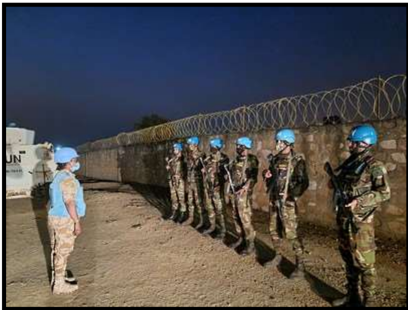
Woman patrol leader providing pre-mission brief

The full, equal and meaningful participation of women at all levels in the UN's military and police components, both as individuals as well as part of formed contingents, remains an operational priority. It is anchored in the