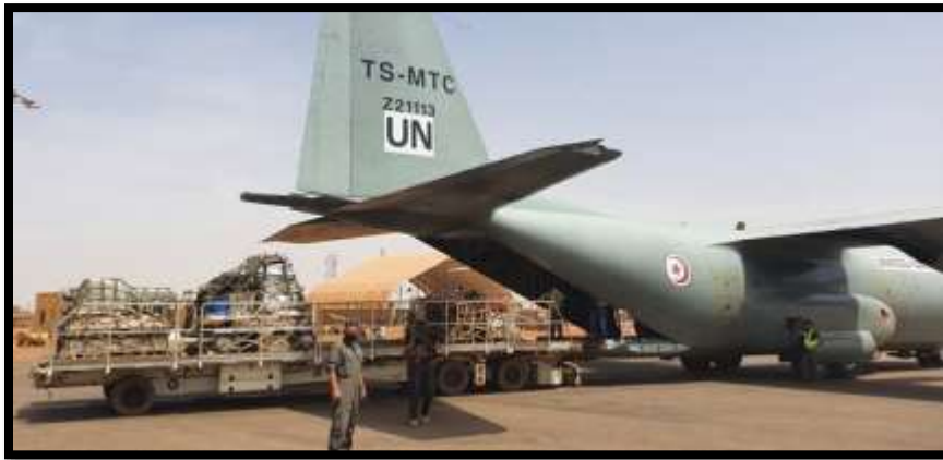
Tunisian C-130 deployed in MINUSMA

The Secretariat is now also seeking air transportation services on a reimbursable basis under a Letter of Assist (LOA) , for one Medium Fixed Wing Cargo aircraft each in support of UNSOS, UNMISS, MONUSCO and MINUSCA (and possibly other UN Missions). The air transportation services may be provided by state-owned aircraft (military or government). For UNSOS, the aircraft will be based in Mogadishu, Somalia (main operations base). For UNMISS, the aircraft will be based in Juba, South Sudan (main operations base). For MONUSCO, the aircraft will be based in Entebbe, Uganda or Goma/Kinshasa, DR Congo (main operations base).