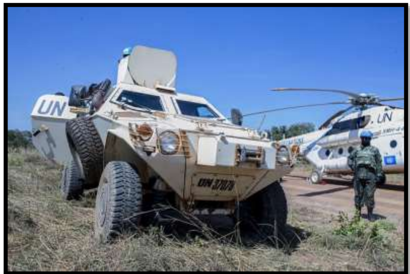
Ground and air mobility requirements

• Aviation is one of the most critical specialized capabilities deployed to peacekeeping. Its multiple functions contribute to mandate delivery through operational and logistics tasks, including support to the safety and security of peacekeepers. Well-equipped aviation assets are in high demand and short supply. Attack, armed and medium utility helicopters; and tactical airlift aircrafts are the most important air assets Member States can contribute to the UN at the moment , and many that have these capabilities have not registered these assets in the PCRS.