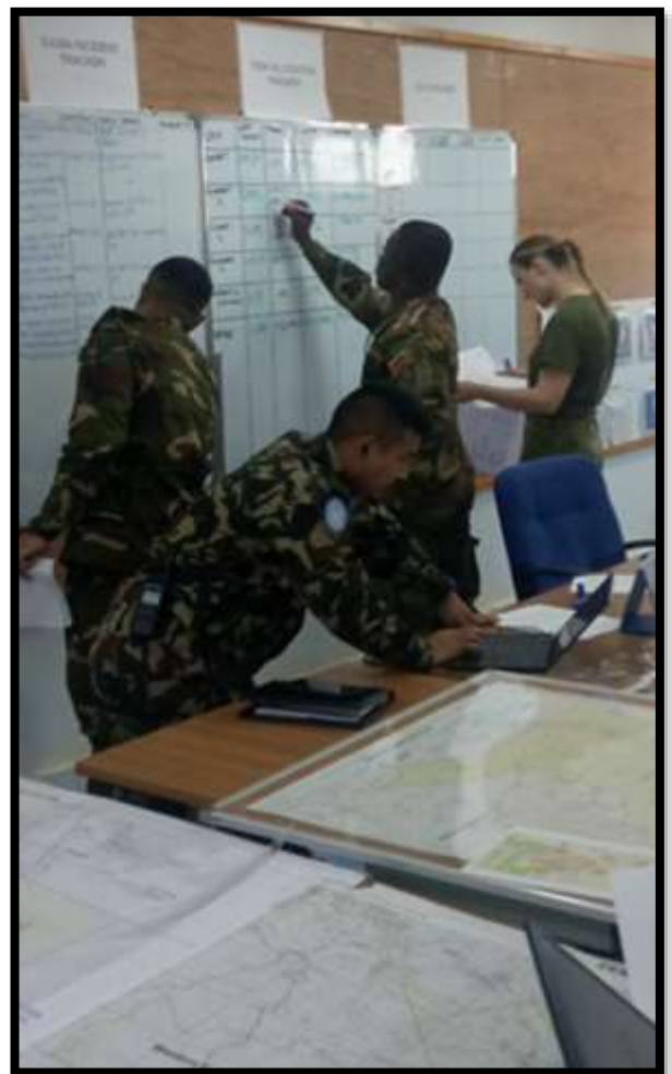
Staff Officer in UNMISS FHQ

Formed Police Units, particularly Francophone and gender-integrated units available for rapid deployment and equipped with state-of-the-art capabilities, including SWAT, rapid reaction, canine and riverine elements.