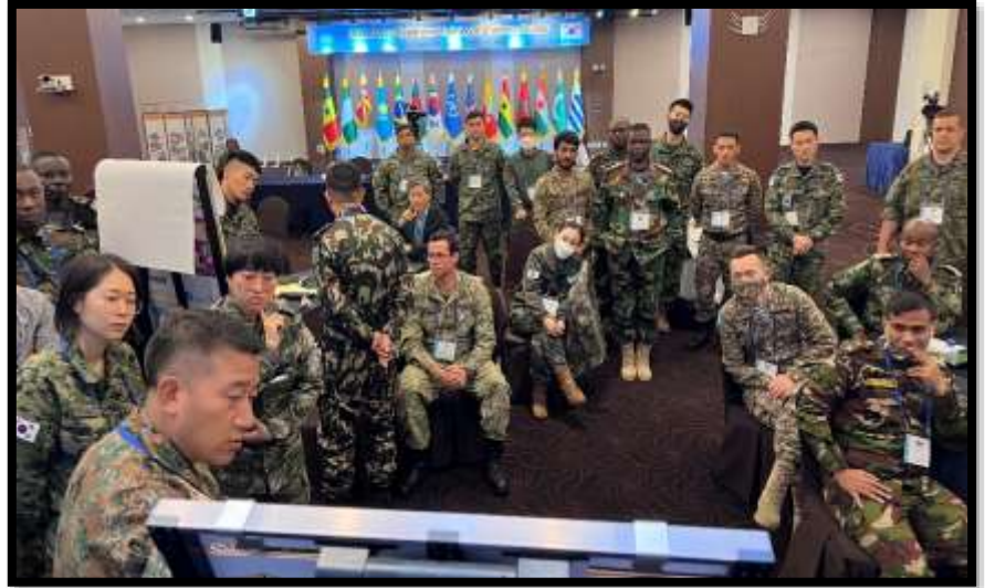
UN Infantry Battalion Commanders Training of Trainers Course in ROK

The United Nations Infantry Battalions (UNIBAT) Specialized Training Materials (STM) have been officially released to all Member States and training of trainer courses will be conducted through 2023. Member States are encouraged to send trainers to attend these courses. The UNIBAT STM are intended to provide TCCs with a comprehensive training package that combines the conceptual, legal, and operational frameworks for Infantry Battalions and Companies, and other UN Military Units with Infantry capabilities, i.e., UN Special Forces units. The STM also include, among others, relevant aspects of Protection of Civilians, Peacekeeping-Intelligence, and Force Protection. They contain small exercises, as well as a more comprehensive scenario-based exercise, which can be run at the end of the training to strengthen participants' understanding on how to operate these units in UN Peace Operations.